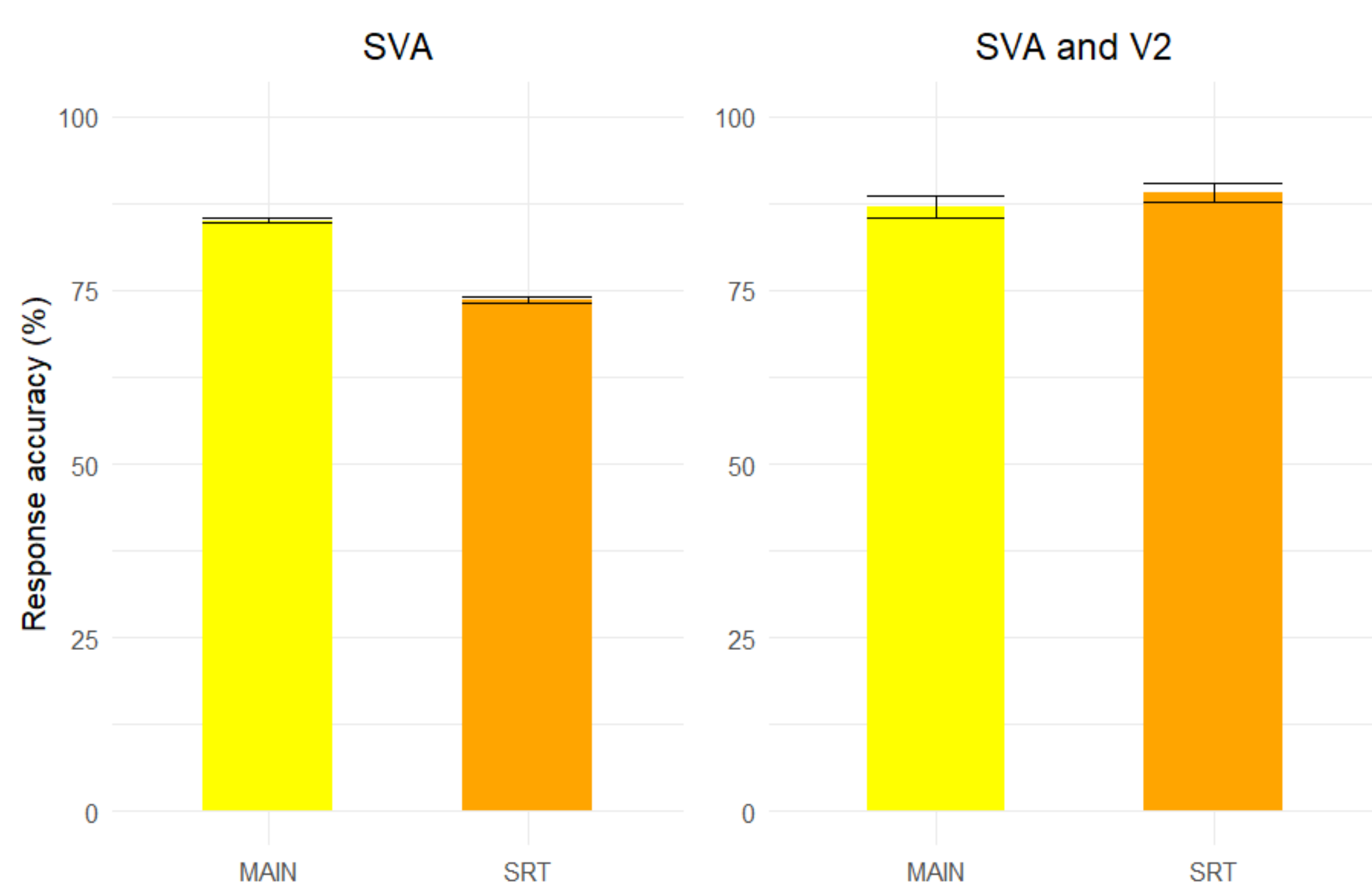
Fig. 3. Overall accuracy of SVA vs. accuracy of SVA with V2. The bars represent the standard error to the mean